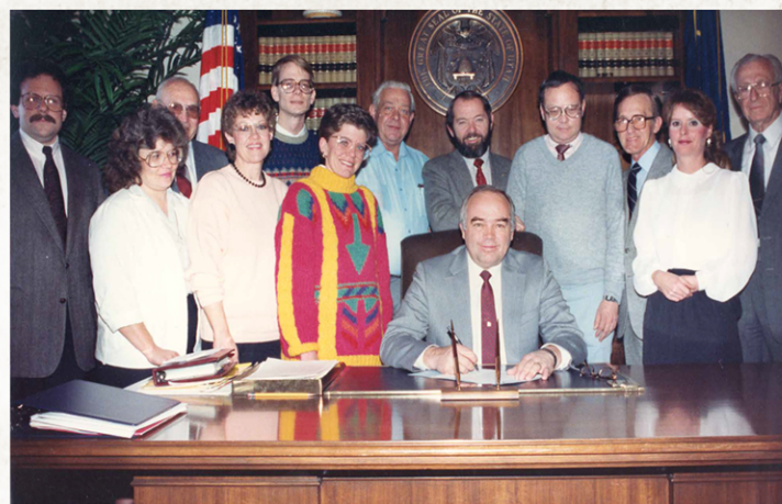
Utah Relay was created by a legislative bill in 1988 and signed by Governor Norman H. Bangerter.

Mortensen’s first term in 1971–1985 was essential in creating the community center. He shared the message “to serve all deaf people, not just rehabilitation consumers.”